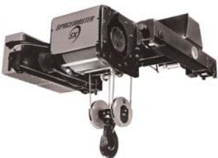
Double Girder Hoist Capacities to 80 Ton