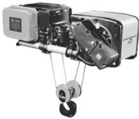
Space-Efficient Low Headroom Hoist