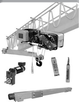
QX Crane Packages