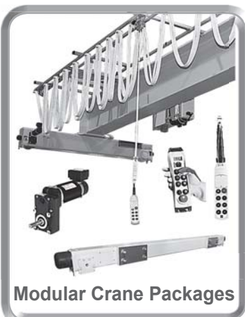
Modular Crane Packages

We invite you to visit us on our web site for further information, to locate an R&M Master Distributor® in your area, or for an up-to-date contact list go to